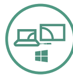
Extended Display Casting