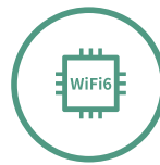
Wi-Fi 6 Chip